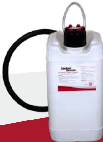
7 Gallon Unit