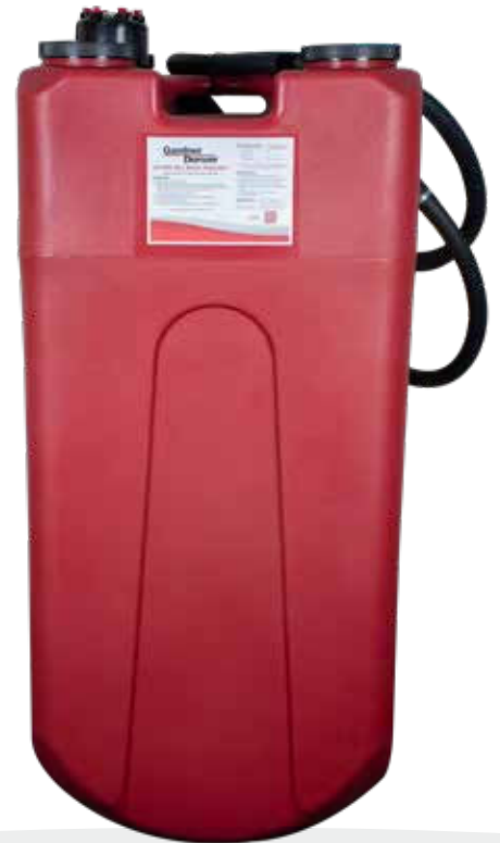
40 Gallon & 60 Gallon Units