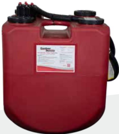
25 Gallon Unit

Instead of opening the unit to replace spent media (a very messy process), when the unit is full, simply dispose of it as non-hazardous waste in accordance with local regulations. If no local disposal is available, ship it back to us and replace it with a new unit. This “fill and replace” method will ensure that both you and your compressor room do not end up covered in air compressor lubricant.